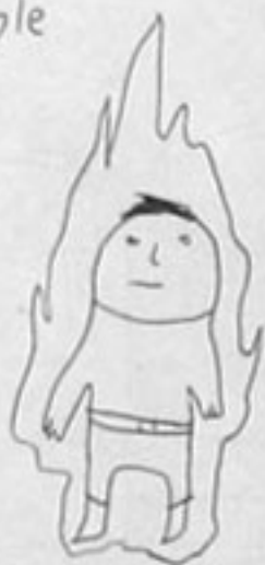
the human torch